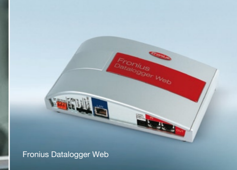
Fronius Datalogger Web