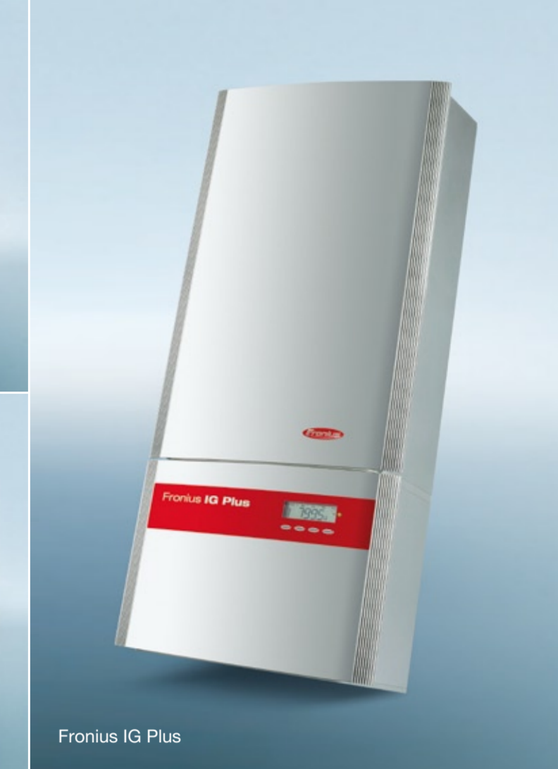
Fronius IG Plus

The easiest way to monitor The most important system data always at a glance.