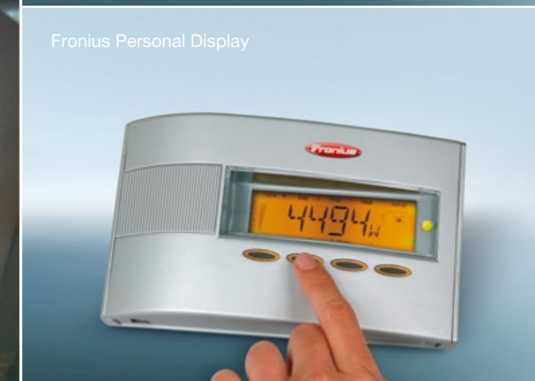
Fronius Personal Display